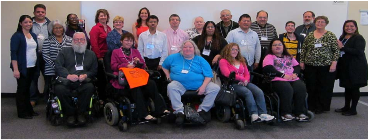
Participants at the Access Now Power Summit

identified issues that are like access, healthcare, education and transportation. Fresno City Council President