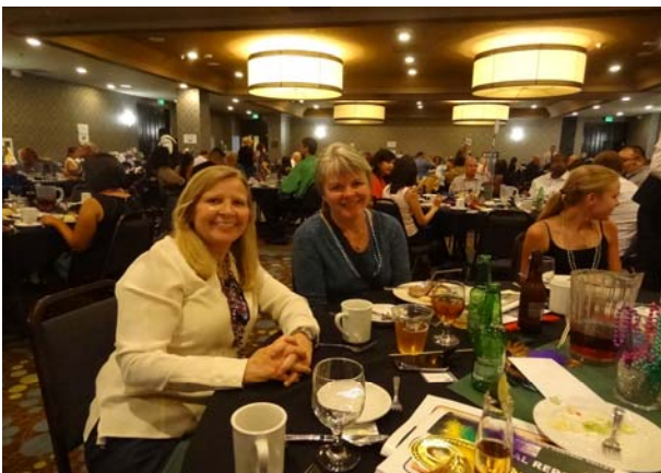
Fun times at the Mardi Gras themed dinner