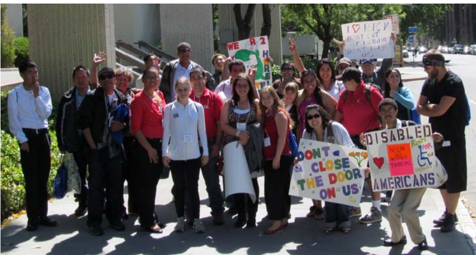
Taking action at Disability Capitol Action Day