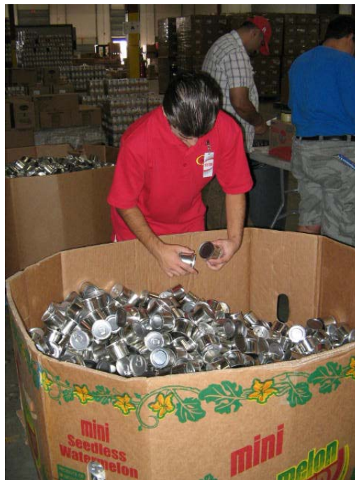
Sorting cans at the Community Food Bank

At the Viking Elementary School, the Ichallenge leadership group distributed potatoes, oranges,