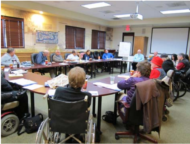
Visalia Advocacy team deliberates on transit problems.

Friday, strives at having an informed community about resources and services which are available to/for individuals with disabilities.