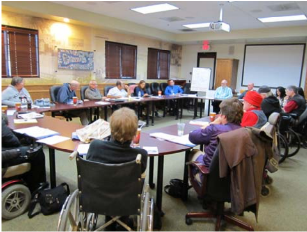
Visalia Advocacy team deliberates on transit problems.

Friday, strives at having an informed community about resources and services which are available to/for individuals with disabilities.