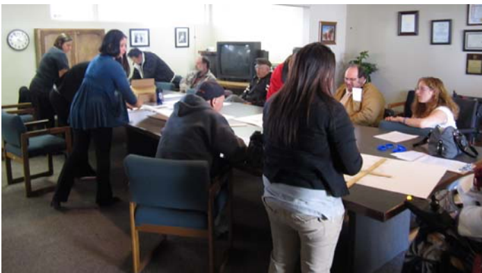
RICV Disability Advocacy Team members & staff from Visalia and Fresno join together to prepare signs for the rally.

It was part of the state wide rallies on the original date of Governor Brown's state budget proposal