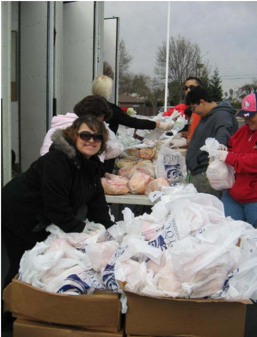
Packages all ready for distribution

The RICV Youth IChallenge group has been nominated for “Hands Across the Valley” volunteer of the year awards.