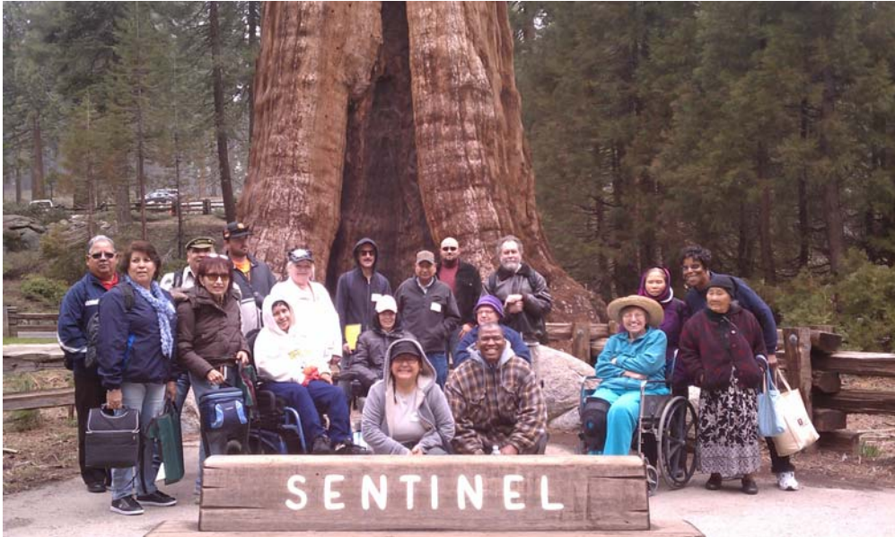
Seniors with disabilities enjoy an outing at the Sequoias

When RICV organized a one day trip to the Sequoia National Forest, it opened up never dreamt of getaway ideas for the group of senior disabled adults.