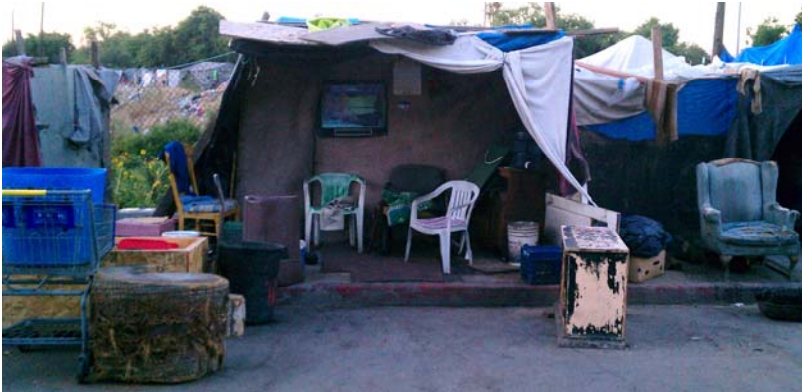
This is their life

Without Intervention they are likely to die on the streets— These are the medically fragile homeless, that were the target of the nationwide P4 survey in mid July.