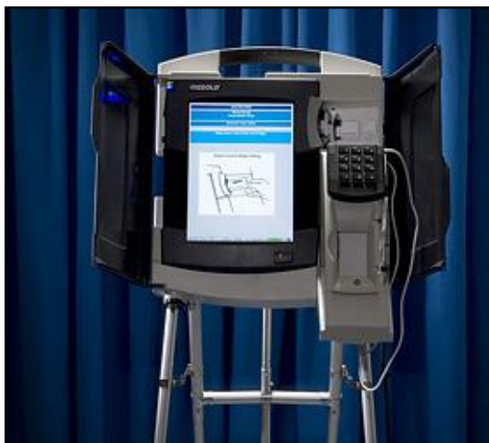
TSX Voting Machine

This month, we are having a training on how to use the TSX Voting Machine, a machine that has been specifically designed to make voting accessible. This has a touchscreen that includes features that allow the text to be enlarged and has an outlet for headphones for a person to listen to (Continued on page 2)